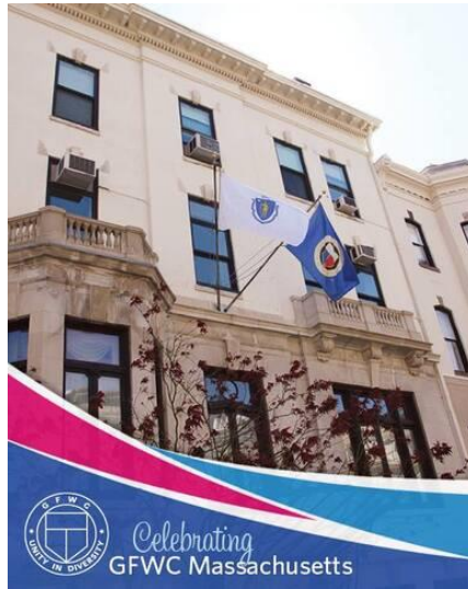
GFWC Headquarters located at 1734 N Street NW Washington, DC 20036