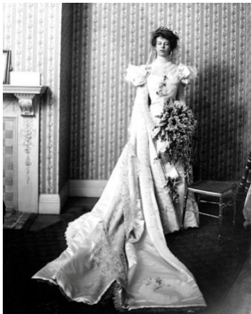
Photo of Eleanor Roosevelt on her wedding day, 1905